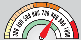
SPM (800 Sticks Per Minute)