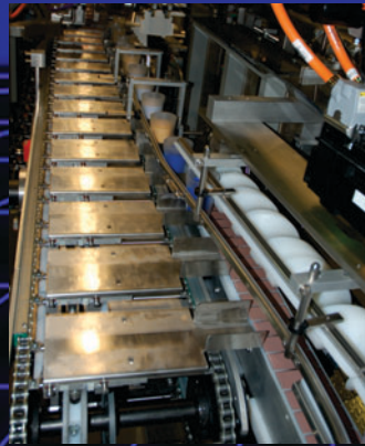
Patented Dynamic Product Bucket Cell Chain