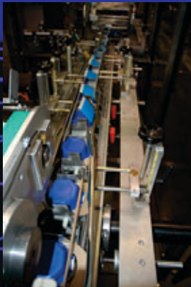
Patented Dynamic Sleeve Cell Chain