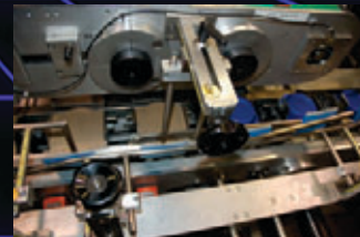
Products Loaded into Sleeves Recipe Driven Closing Station