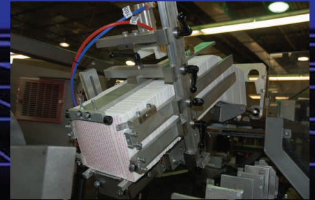
Configurable with Partition Feeder for Multi-Product Separation