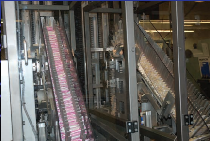
Dual Product Vertical Collation Systems for Variety Pack