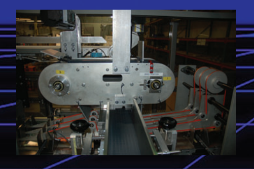
Servo Driven Product Sweeper