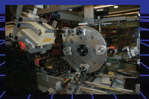
Postive Carton Control