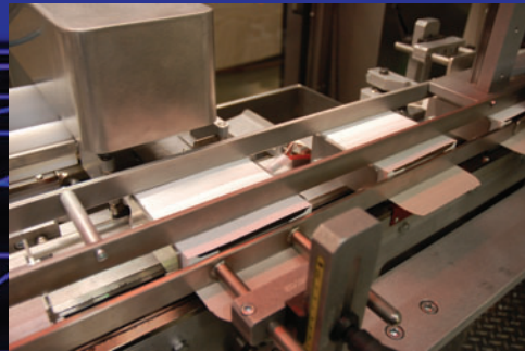
Smooth Jam Free Loading