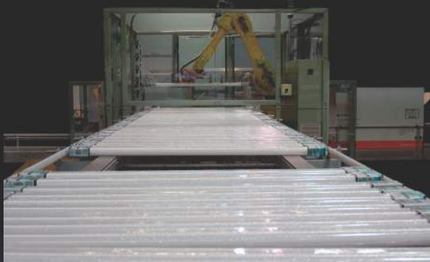
Product Accumulation Conveyor