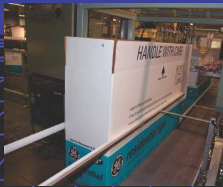
Case Loading Conveyor