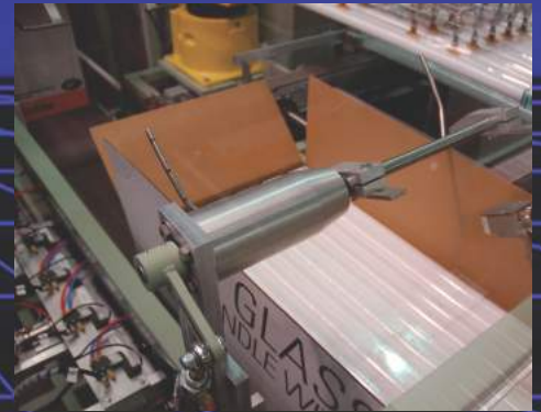
Robotic Loading Station